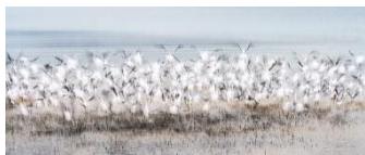
Arctic Terns Malcolm Wood ARPS Best Nature Print - D. R. Grey Cup