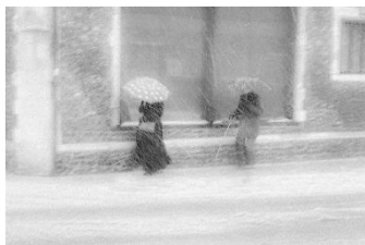
Snow Storm Tom Watson Best People Print - Colman Cup